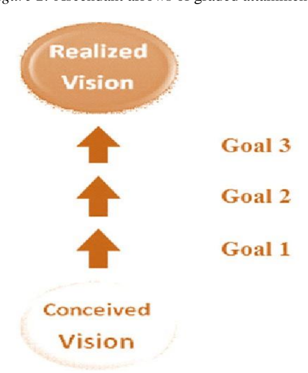
Figure 2: Ascendant arrows of graded attainments

Goals, also, are not arbitrarily executed but are realized one by one in an ascending order of visionary relevance (Nakolisa, 2006). It is in this sense that goals can be said to be ascendant arrows of graded attainments. (See Figure 1.1)